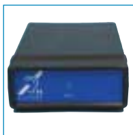
PL Phase (for reduced spill over)