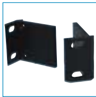
PLRM 19" rack mounting bracket allowing easy installation into standard 19" cabinets